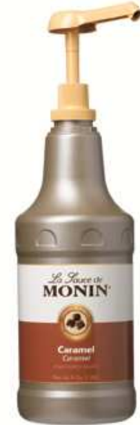
Sauces 3 flavors