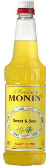
Bar mixer Together with cordial, bitter...