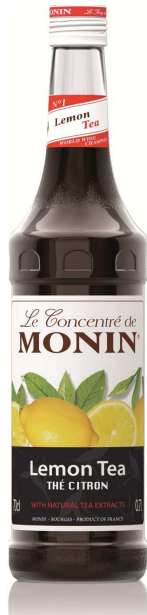
Tea concentrate 5 flavours