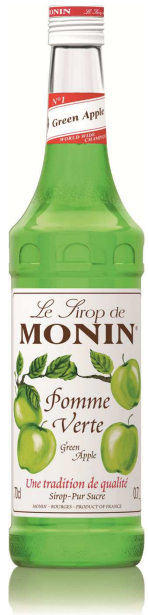
Syrups over than 100 flavours