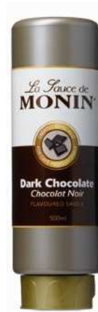
Topping sauce 3 flavors