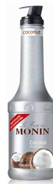
Le Fruit de MONIN 8 flavors